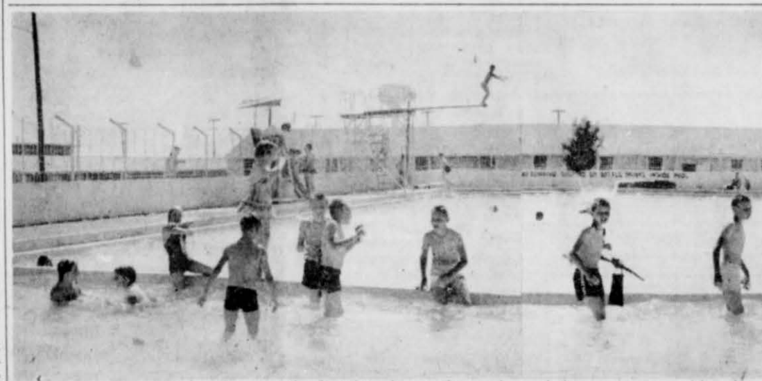
Wednesday was the first big day at the pool—and the water was cold and crowded.