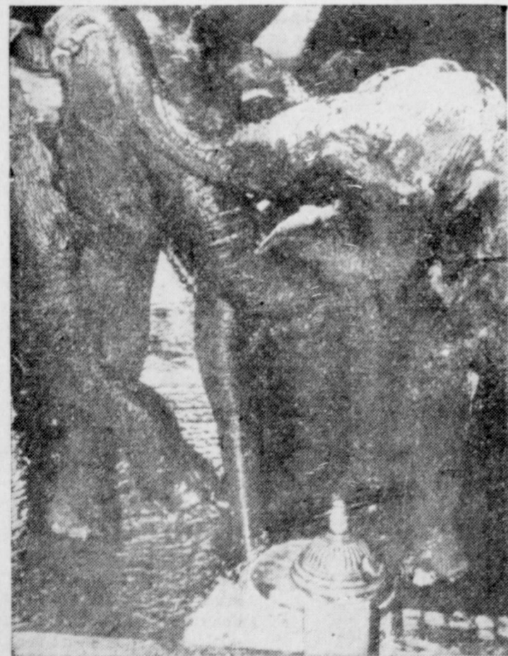
CIRCUS BELLES Mabel and Mona frolic in water released from fire plug in Philadelphia. When truck transporting elephants from Atlantic City to Pittsburgh broke down, firemen took pity on big animals and released refreshing spray.