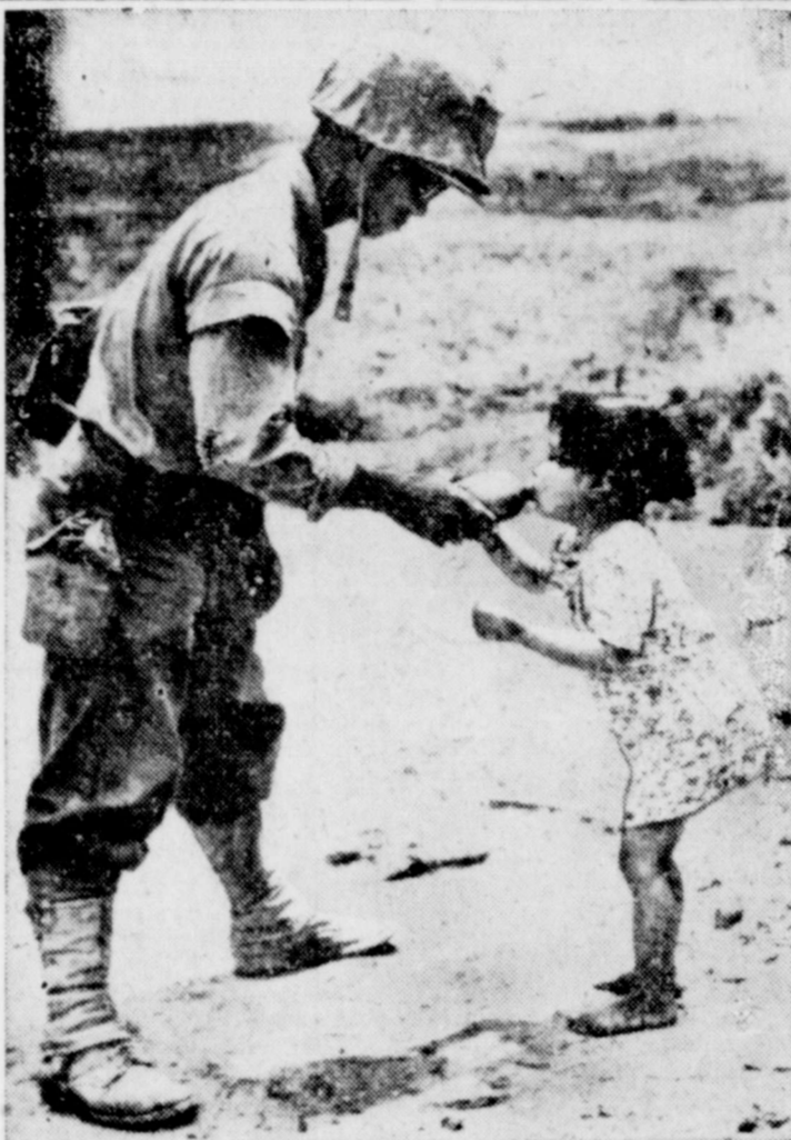
INNOCENT VICTIM —Small native girl drinks from canteen of Marine who found her on Okinawa. The innocent victim of vicious battle was brought to settlement which Allies maintain for protection of civilians on island.

JANETTE'S BEAUTY SHOP. 107 West Eighth. Phone 9.