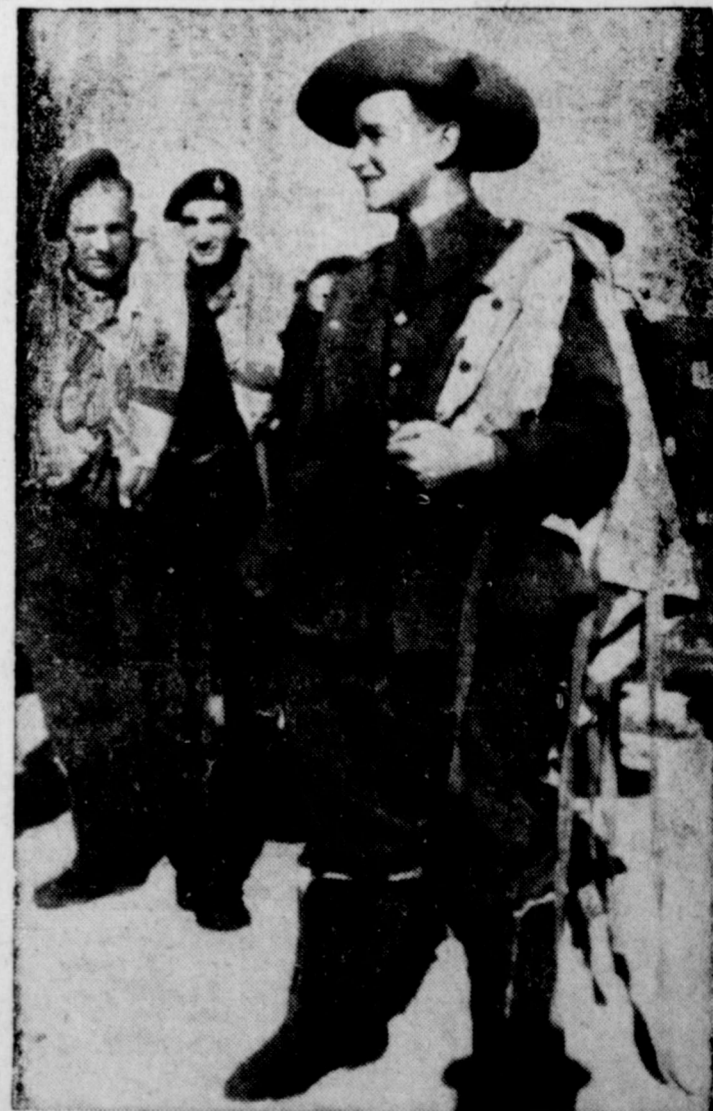
READY TO FIGHT—British captain waits with other Tommies to board Royal Air Force Transport Command Dakota at airfield in western England. Big plane will carry soldiers to India on first lap of journey to join Allies in war on Japs.

WASHINGTON, July 6.—Former Secretary of State Hull was discharged today from the U. S. Naval Hospital at nearby Bethesda, Md., where he had been a patient since last October. Physicians attending the 73-year-old former secretary said hospitalization was no longer necessary in view of his "most satisfactory recovery." He had been undergoing treatment for a throat ailment.