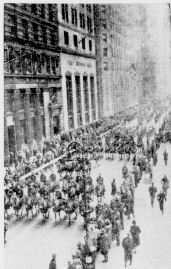
RECEPTION FOR ITALIAN PREMIER —Mounted police and Army band and troops precede motorcade down Broadway, New York City, for traditional City Hall reception in honor of Italian Premier Alcide de Gasperi. Reception climaxed two days of public festivities in his honor.

MINNEAPOLIS, Jan. 24. — Three firemen were killed and seven more injured, one of them critically, last night when fire followed by a series of explosions destroyed a Minneapolis auto showroom and garage.