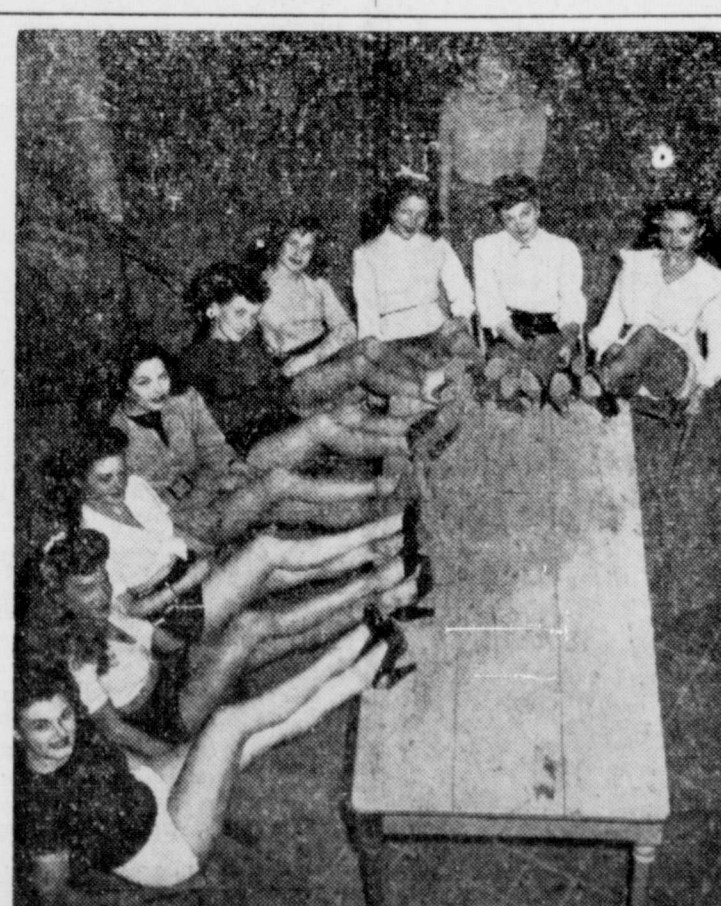
BOARD DIRECTORS-Looking like top-drawer business executives with their legs supported by the table, this aggregation of dancers takes time out between movie takes at a Hollywood studio. The girls were recruited from all sections of the U.S.