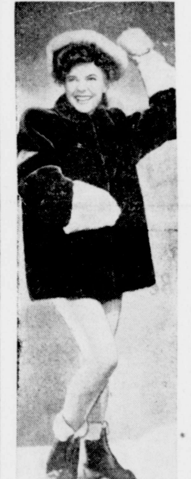
SHORT AND SWEET-Louise Snyder, actress, doesn't seem to mind the winter breezes as she gets ready to heave a snowball. Photo was taken as a gag and with "props" when New York temperatures soared to