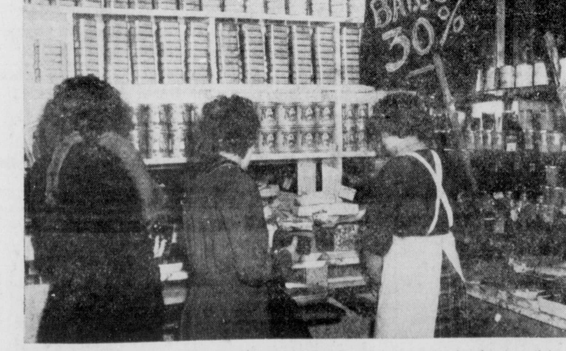
THE PRICE PENDULUM SWINGS BACK in Paris. Here French housewives take advantage of sign announcing 30 percent slash in prices as they stock up on food at this grocery store in France's capital. Many stores exceeded former Premier Blum's ordered decrease of five percent.