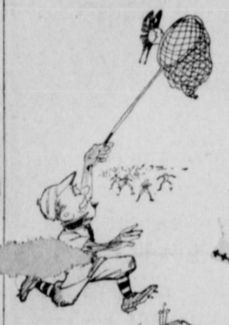
Caught 'Em on the Fly.