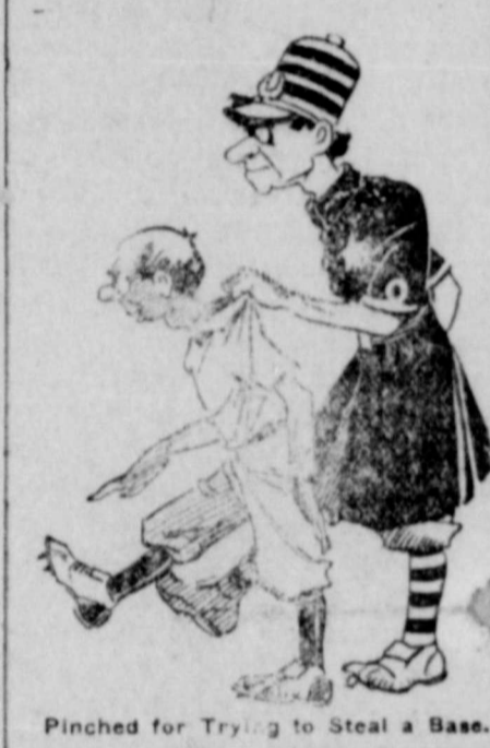
Pinched for Trying to Steal a Base.

In the seventh Lockney played "Ring around rosie" for eight runs. The local fans looked like they enjoyed the races immensely.