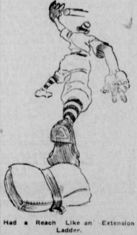
Had a Reach Like an Extension Ladder.