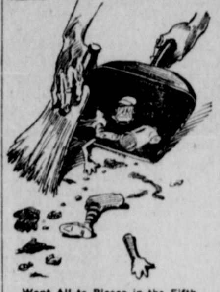
Went All to Pieces in the Fifth.