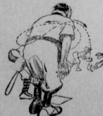
Getting the ball to second seemed like tossing peanuts to a monkey.