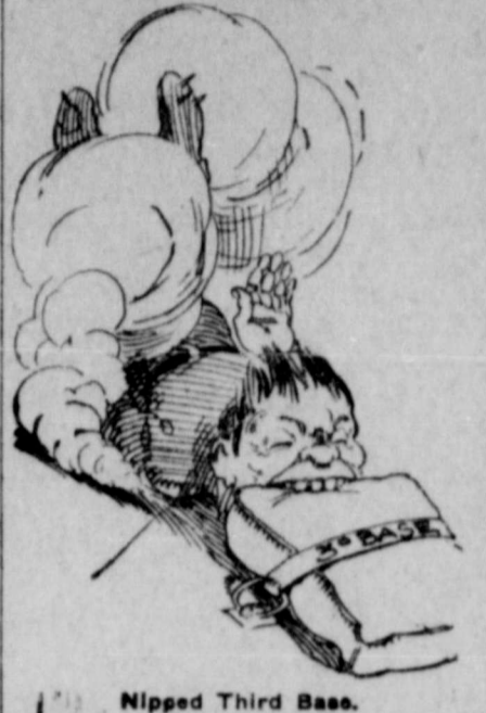
Nipped Third Base.

Osburn McCollum had them roped and tied at short stop. He picked them so easy.