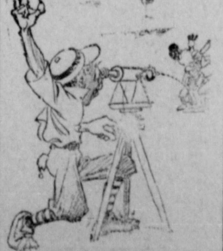
Needed instruments to locate plate.

In the fifth enning Petersburg went to pieces and it took a fine tooth comb to find the pieces. Lockney scored faster than the score keeper could count them. And again in the 8th enning Petersburg let in several base runners.