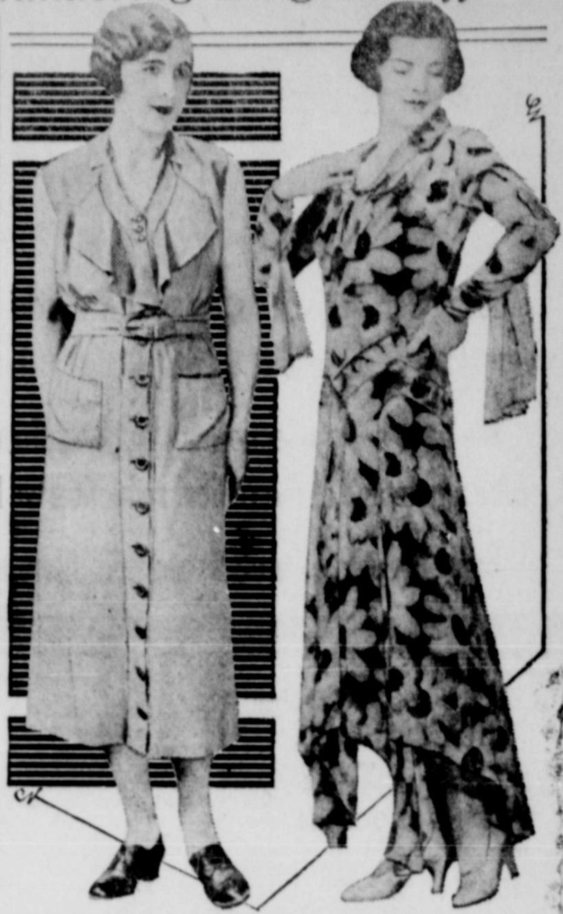
Smart as well as practical is the egg-colored wash silk, at the left. It has a novel turned down collar and double jabot effect. Excellent for afternoon wear is the floral chiffon, right, trimmed with the frock's material. Notice the effectiveness of the scarfs swinging from each wrist.

The long sleeves have a little scarf swinging from each wrist,