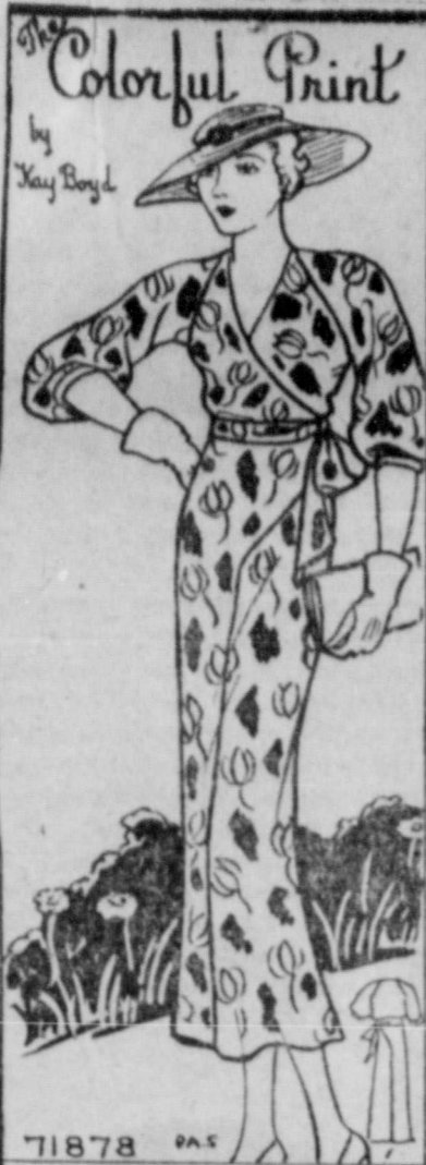
71878 P.A.S. For A PATTERN, size 34, 36, 38, 40, 42 or 44, send 15 cents in coin, your NAME, ADDRESS, STYLE NUMBER and SIZE to Kay Boyd, 103 Park Ave., New York City. Complete and simple sewing chart with each pattern.

can be let down for sunbathing. The cellophane parasol is the trickiest beach accessory this season. Pale yellow, like the golden lights in the suit, it keeps the forest of the sun's rays off a girl, yet doesn't hide her beauty.