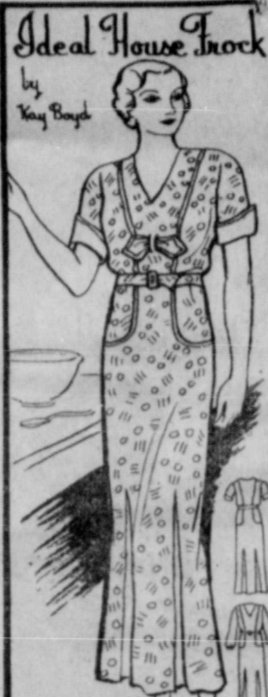
71908 P.A.S. For A PATTERN, size 38, 40, 42, 44, 46, 48, 50 to 52, send 15 cents in coin, your NAME, ADDRESS, STYLE NUMBER and SIZE to Kay Boyd, 103 Park Ave., New York City. Complete and simple sewing chart with each pattern.

Size 34 requires 4 5-8 yards of material. The sash requires 6 inch material.