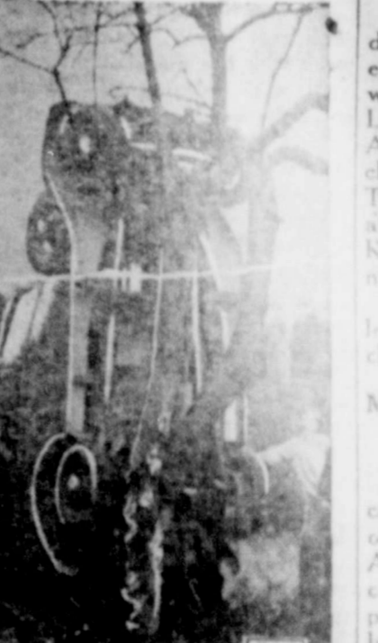
SEATTLE... Here's one of those things that can't happen, but do. It is a tree-climbing truck, achieved by racing wildly down a busy street, narrowly missing pedestrians and automobiles, plunging over a 50 foot embankment... then climbing the tree, without injury to any one.