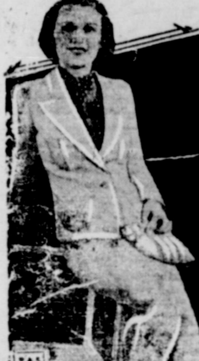
CHICAGO Here is another change for that budget wardrobe, a tailored white non-crushable linen dress suit, with which is worn a marine blue scarf and white accessories. It's quite inexpensive. This model is shown in the Cotton Carnival at the Merchandise Mart here.

interesting general discussion of Egypt.