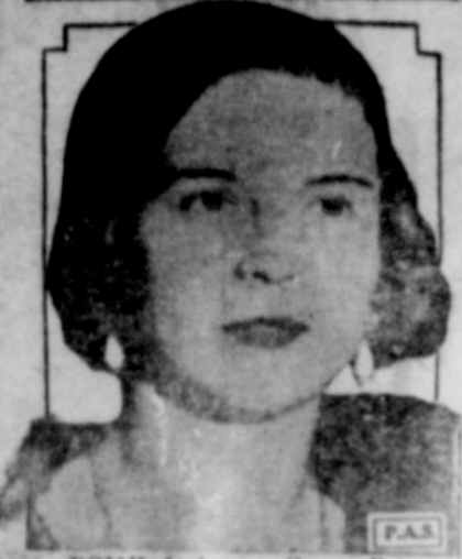
ROME, Italy... Crown Princess Marie Jose (above), sharing the lot of all royalty, is now aboard the hospital ship, Cosarea, off the East African coast, where she is ministering to the wounded from the front.