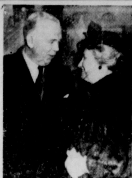
OFF FOR LONDON . . . Secy. of State George Marshall says goodby to his wife at Washington airport before leaving for the Big Four foreign ministers' conference on German and Austrian peace treaties in London.