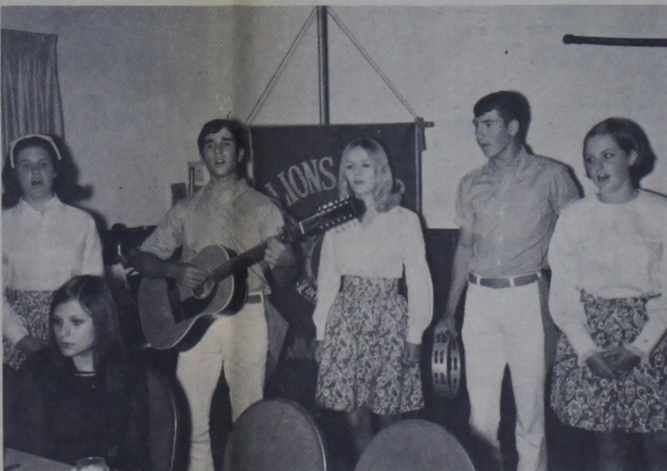
HAPPY SOUND — These Dimmitt High School students make up the "Sinn Fein" (Ours Albane) ensemble, which drew a long, enthusiastic ovation after a 15-minute folk-novelty performance at the Dimmitt Lions Club's annual Ladies' Night Banquet Monday night at the Colonial