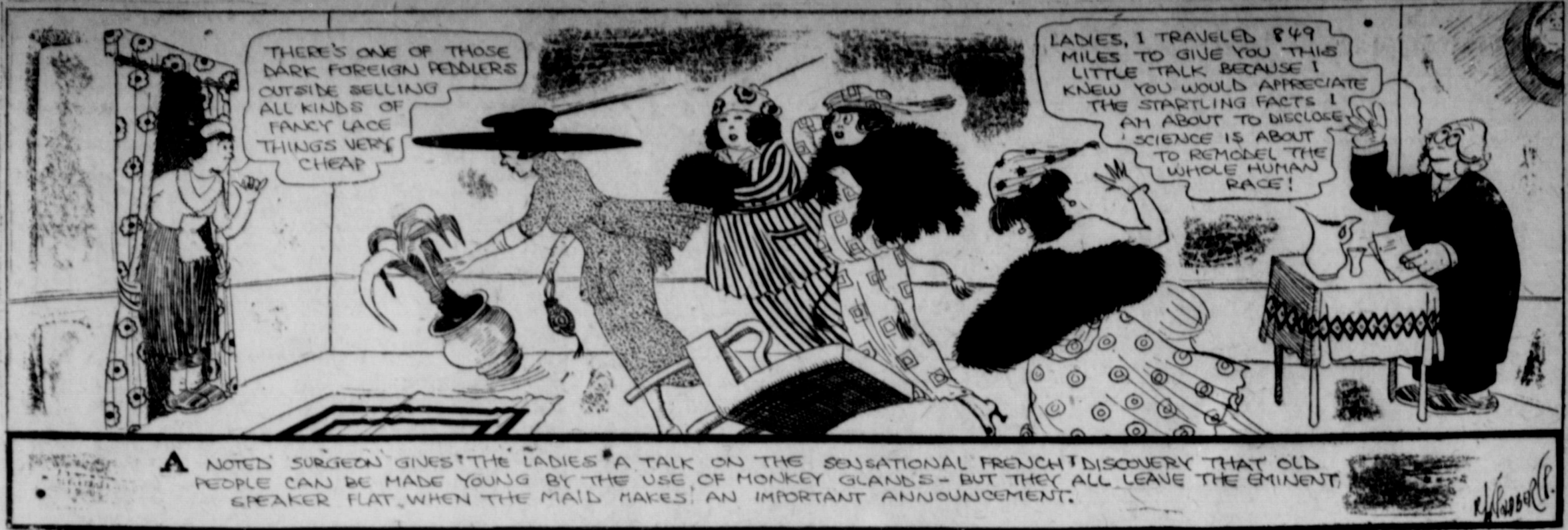
A NOTED SURGEON GIVES THE LADIES A TALK ON THE SENSATIONAL FRENCH DISCOVERY THAT OLD PEOPLE CAN BE MADE YOUNG BY THE USE OF MONKEY GLANDS - BUT THEY ALL LEAVE THE EMINENT SPEAKER FLAT, WHEN THE MAID MAKES AN IMPORTANT ANNOUNCEMENT.

miners that their fight also was to the finish.