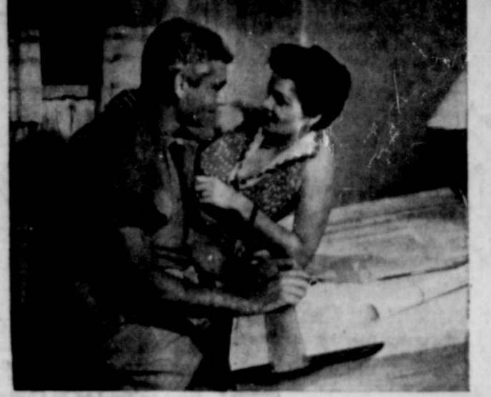
Jane Russell and Jeff Chandler in a scene from their Technicolor picture "Foxfire" showing Wednesday night with a Thanksgiving matinee at 1:45 Thursday afternoon at your Tower Theatre.