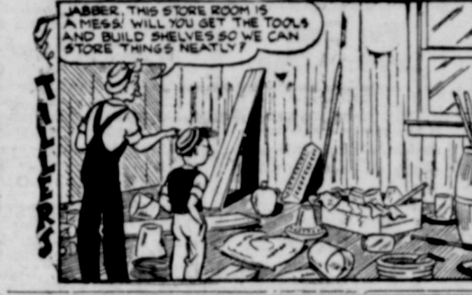
JABBER: THIS STORE ROOM IS A MESS! WILL YOU GET THE TOOLS AND BUILD SHELVES SO WE CAN STORE THINGS NEATLY!