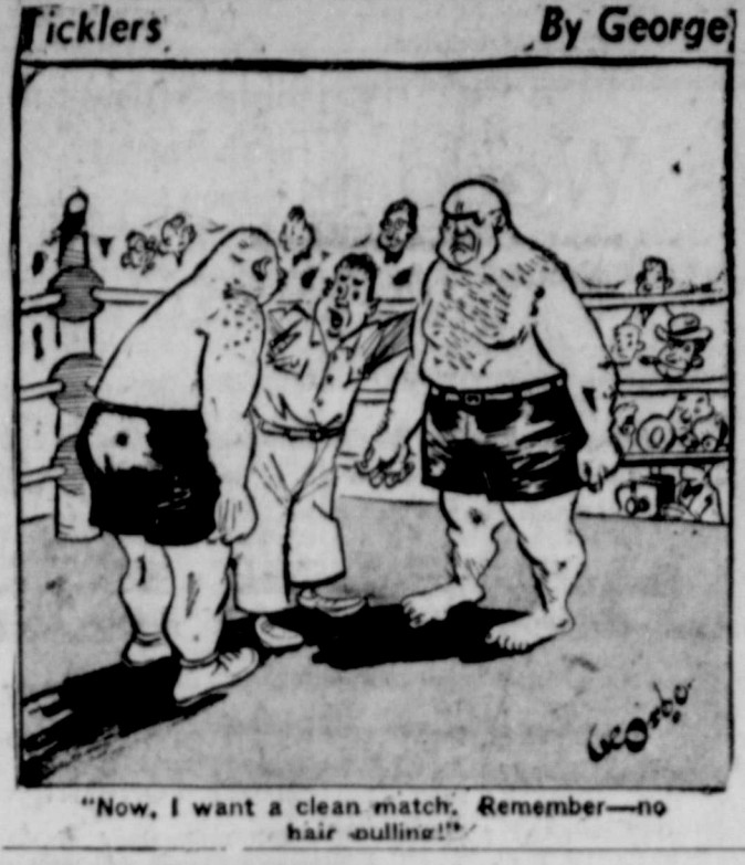
"Now, I want a clean match. Remember—no hair-curling!"

Disaster Strikes The engine overheated, the radiator boiled dry frequently. Water had to be carried from numerous rain-lakes to the music of thousands of ducks resting on their annual southern trek. Disaster struck in the Panhandle. Southward as far as Joe could see stretched two deep ruts, so deep that other cars and wagons had made a parallel road on the highway shoulder. It looked formidable, but there was no turning back. Suddenly the steering arm, suspended slightly below the front axle, struck a rock in the high center between the ruts. It had to be taken off, heated in a