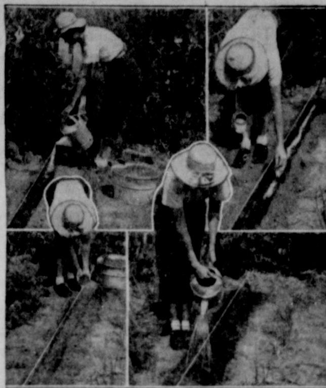
Top Left: Make Deep Drill and Soak Soil Deeply. Top Right: Mix Seed With Sand and Sow on Damp Soil. Lower Left: Cover Seeds With a Special Porous Soil. Lower Right: Keep Soil Moist Until Seeds Germinate.

Most amateurs have small difficulty in growing plants from seed in cool, moist, spring weather. But in the hot, dry weather of summer it is often a different story.