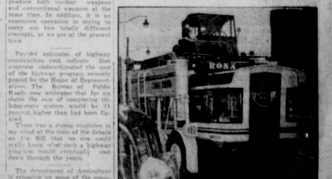
PEE-PUL POD —A newly developed passenger pod will solve the problem of getting people to jet aircraft. The pod, capacity 16 people, is picked up by a straddle carrier and carried out to the plane. Then the carrier raises the pod to the runway and the passengers simply walk from pod to plane. The system, being shown, above in Cleveland, Ohio, traffic has been developed by Clark Equipment Company's Industrial Trucks Division.

TV HEADQUARTERS RCA, Admiral, Philco, Zenith L & J SUPPLY CO.