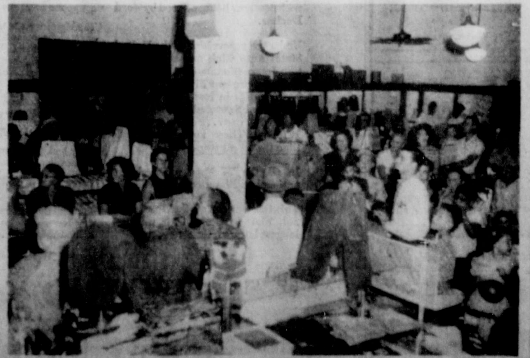
PREVIEW OF WARD WEEK: The crowd pictured above is a small portion of the people from Ranger and surrounding territory that turned out for a preview of Ward Week that began in the Ranger store on October 9. Coffee and sandwiches were served and favors were passed out for the kiddies. Customers spent the evening looking over huge stocks of merchandise and making pre-sale selections.