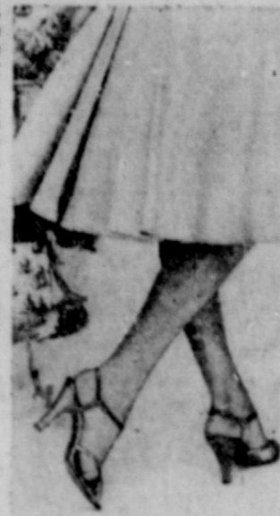
Sandalfoot stockings by Hanes are crystal clear, proportioned to fit perfectly. She'll welcome hosiery in any amount from one pair to a dozen in a sheer weight she might not buy for herself.

For the girl who likes walking and a country life, there are the new walking sheer stretch hose in loden green, charcoal gray, slate blue, crimson or moss.