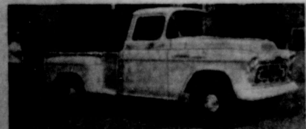
Whatever your job, there's an Alcan-proved Chevrolet Task-Force truck ready right now to save you time and money!

New V8-powered '57 Chevrolet trucks, heavily loaded, made one of the world's toughest roads look easy! In a straight-through test run, they ralloped over the famous ALCAN Highway to Alaska—in less than 45 hours (normally a 72-hour run). Here's proof-in-action of power that'll handle your toughest jobs—and keep coming back for more!