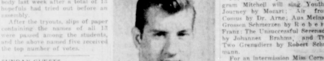
MAINTENANCE BUILDING: The old National Guard Armory in Ranger, valued at $20,000, will be used as a maintenance building for all of Service Battery's motor vehicles when the new $80,000 Headquarters Building is opened, thus removing all the dirty work from the new quarters. The Guard now has an investment of $100,000 in Ranger property which will one day be a "show place" here when all the finishing touches are put to it. The new building will be dedicated Saturday afternoon and evening.