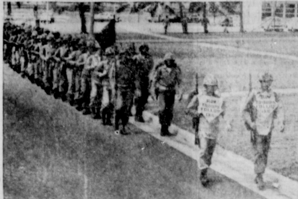
FOLLOW THE SIGNS—Safety first gets a novel twist in Kaneohe Bay, Hawaii, as a pair of U.S. Marines become moving traffic signs leading a column of troops marching along the road. The traffic warning panels alert approaching vehicles to the oncoming men.