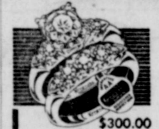
RUEWELL $300.00 Wedding Ring 100.00

GUARANTEED PERFECT Many Styles - Many Prices