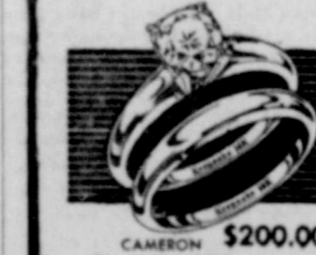
CAMERON $200.00 Also $100 to 2475 Wedding Ring 12.50