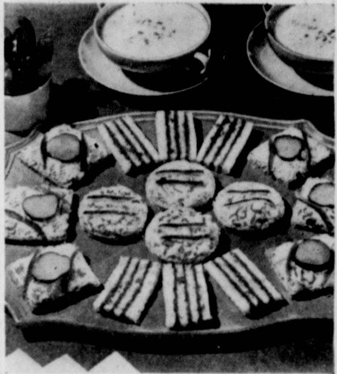
Party sandwiches like these look and taste good. Lavish use of pickles adds interesting flavor to tidbits and spreads.

One 6½-ounce can crab meat, ½ tablespoons finely chopped onion, ½ cup chopped sweet