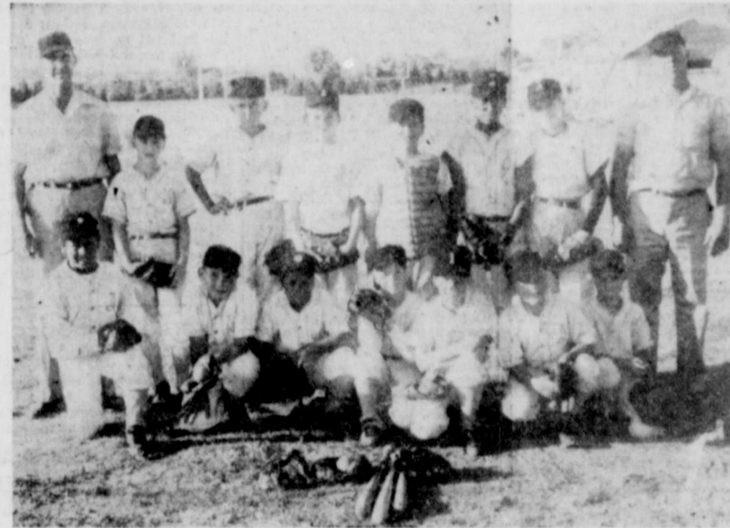
NECK AND NECK FIGHT: The Little League Giants (top photo) and the Indians (lower photo) are in a neck and neck fight to the finish as all four Little League teams race for the wire next week, with the schedule ending for the season on Thursday night, July 25. The Indians are 1/2 game behind the Giants, but have a mathematical chance to win. The Dodgers are apparently out of the race since they are 3 1/2 games behind with the league leading Giants having only 3 more games to play, including the make-up game with the Yankees. The Giants could lose all three games and still come out ahead of the Dodgers, but the Indians have a chance to beat them.