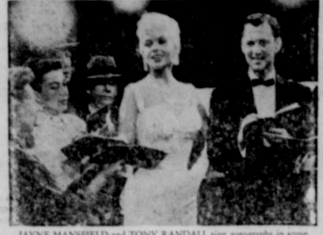
JAYNE MANSFIELD and TONY RANDALL sign autographs in scene from 20th Century-Fox's "WILL SUCCESS SPOIL ROCK HUNTER?"