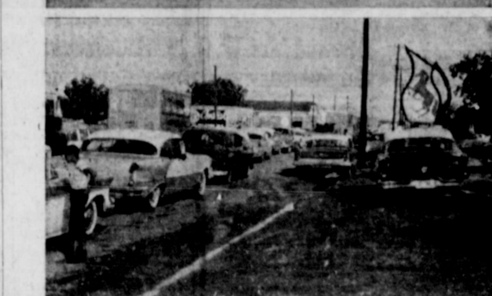
LOOKS NATURAL: These cars inching their way across Leon River where it overflowed Highway 80 at Eastland Sunday are reminiscent of last Spring, only it was worse this time with the Highway being completely blocked for a while last Sunday afternoon.