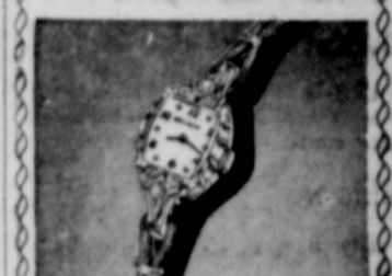
GODDESS OF TIME 17 Jewel, 2 Diamond $4950