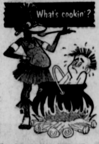
What's cookin'? The Russians may have launched the first Baby Moon, but shucks, how many golf balls have they launched lately?

TEENY WEEZY GAS BURNERS Largest selection of new models, hardtops, convertibles in this area. Prices start at $1095. TOM'S SPORT CARS Eastland