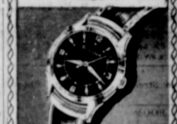
SENATOR 17 Jewel, certified waterproof, shock resistant, unbreakable link bracelet, anti-magnetic, radium band & dial, luxury expansion band $4850

Ranger Jewelry Company Paramount Hotel Bldg.