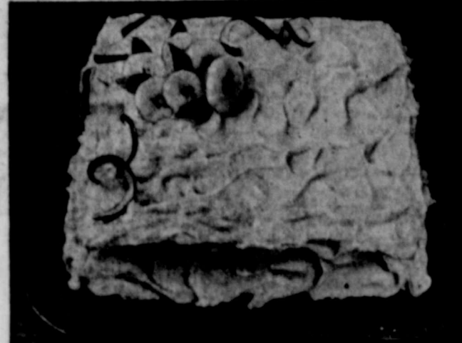
Spice Cake, an all-time favorite, is even more delicious and certainly easier made with a new instant Banana Cake Mix. Try it!

Banana Spice Cake, Lemon Frosting 1 package instant banana cake mix 1 1/4 cups water 2 eggs, unbeat 1/4 teaspoon cinnamon 1/4 teaspoon nutmeg 1/4 to 1/2 teaspoon cloves