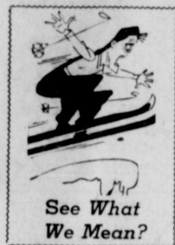
See What We Mean?

That the scouts will participate in at least three safety projects next year, traffic safety in the spring, outdoor safety in the fall, and home safety in the fall.