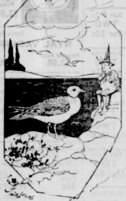
"Indeed I Do," Billie Brownie Answered, "But Do Tell Me More."

tinued, "for years and years there have been gulls."