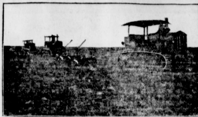
Three 10 Ton Holt Caterpillars on the Myrick Farms