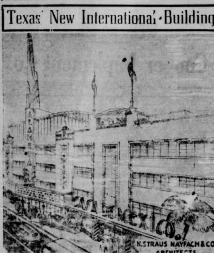
San Antonio's Casa de Mexico International Building, first structure in the nation built specifically to house firms doing business with Latin American countries, now is in final stages of completion. Consul General of Mexico was the first tenant.