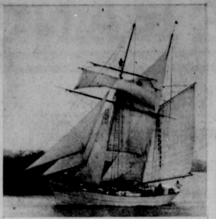
YANKEE GOES HOME—The brigantine Yankee slides gracefully through the water as she leaves Hamilton, Bermuda, on the last leg of a two-year round-the-world trip. She headed for her home port of Gloucester, Mass. The 95-foot craft covered 48,000 miles.