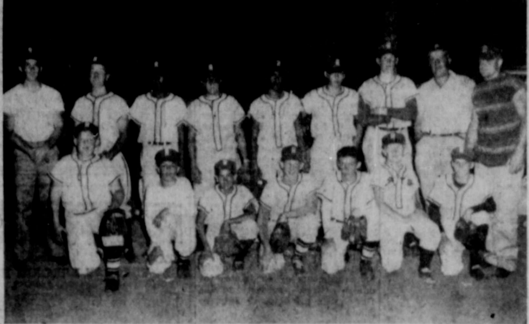
PONY LEAGUE JUNIOR LEAGUERS are pictured above as they appeared at the Tuesday night game with Baird, which was called off due to rain.

FREE HOME TRIAL on RCA Whirlpool Appliances RANGER FROZEN FOOD CENTER