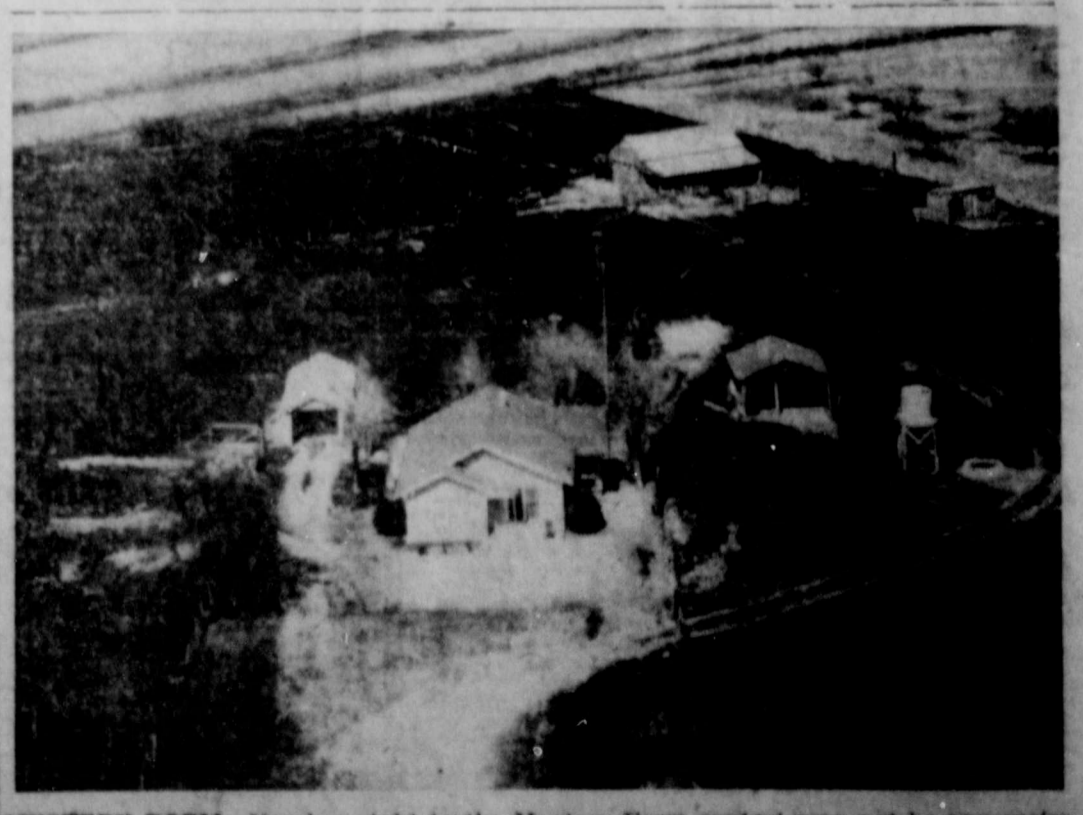
MYSTERY FARM—Number eight in the Mystery Farm contest may not be any easier than the seventh farm was. The seventh mystery farm was the hardest so far. If correct answers are any indication, the names of all persons correctly identifying the farm will be placed in a hat and one name drawn out. That lucky person will receive two tickets to the Majestic Theatre. If the owner of the farm comes in to identify the farm, he will receive a free enlargement of the aerial photo.

Fire - Casualty - Automobile M. L. KING INSURANCE AGENCY Phone 75 808 Main St