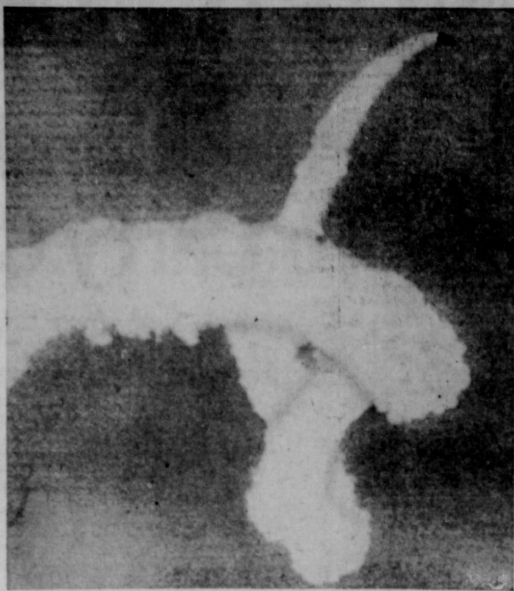
A NEW TWIST —A Navy Polaris missile, fired from Cape Canaveral, Fla., leaves this strange twisting trail as it thunders into the skies. The solid-propellant missile, designed to be fired from submarines underwater, was deliberately fired this way to test its recovery from the abrupt zig-zagging path.