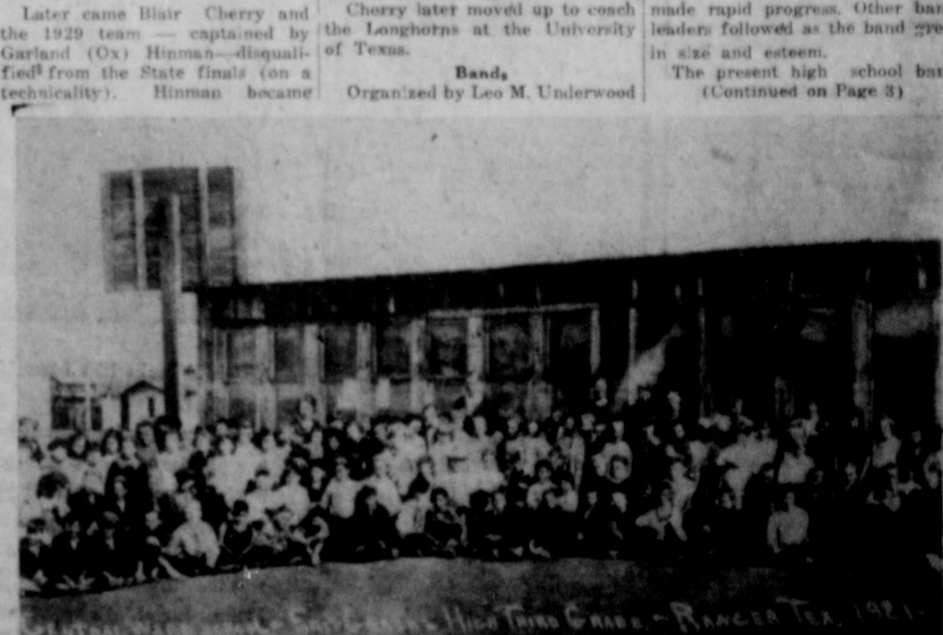
ARE YOU IN THIS PICTURE?—If so, give us a ring. It's the First Grade and "high Third Grade" at Central Ward School, taken in 1921. Notice the frame buildings in the background, the wooden ward school and the basketball backboard.