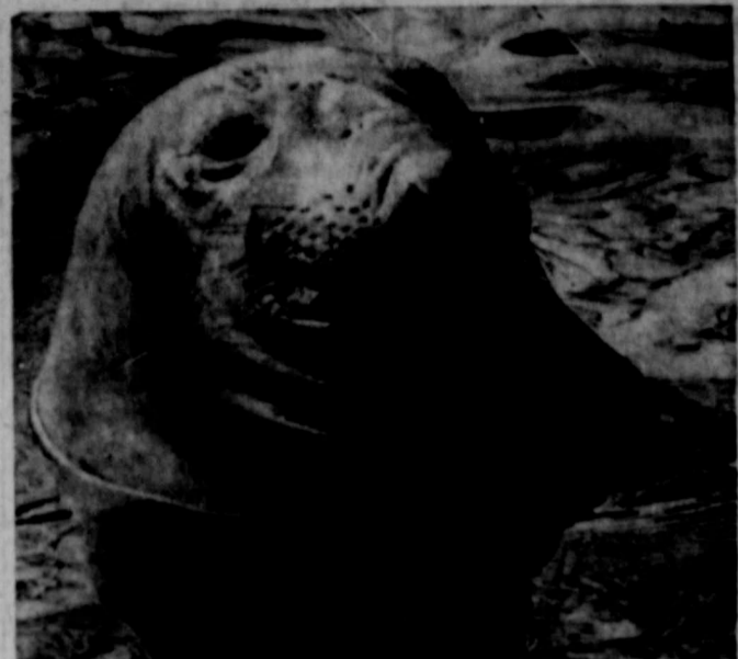
SEAL OF APPROVAL—Life's fine and dandy for Roland, an elephant seal at the West Berlin Zoo. He's enjoying the sunshine in his pool. From that contented grin, it isn't likely he's about to exercise off those multiple chins.