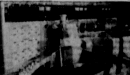
Oldsmobile's right inspection system insures that highest quality standards are maintained all along the line. Amazing electronic devices eliminate any possible human error.

SEE YOUR LOCAL AUTHORIZED OLDSMOBILE QUALITY DEALER