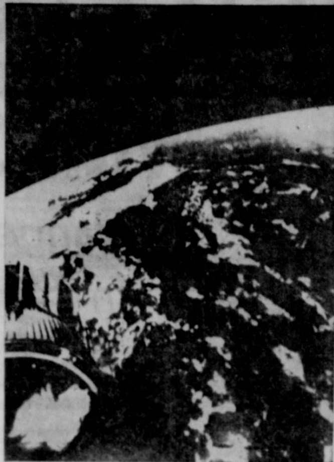
EARTH FROM 200 MILES UP—This photo of the earth was taken from a recovered nose cone of an Atlas rocket launched Aug. 24. Visible is Florida, left, center, and the main stage of the rocket, shown dropping away from nose cone, lower right.