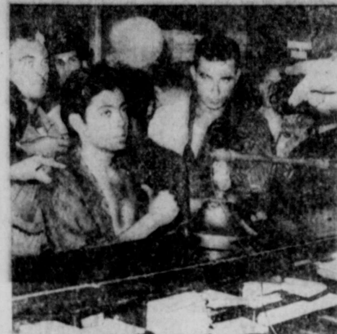
FINGER OF ACCUSATION Pointing fingers pick out 16-