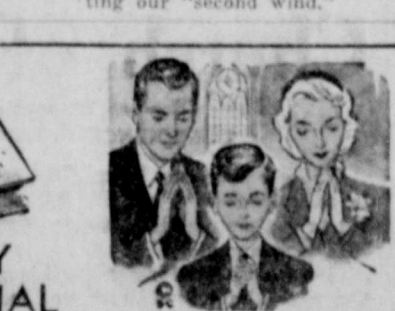
SUNDAY when he walks to the altar of the

Actually, age and experience are The latest enrollment report plus factors when returning to 121 fulltime day students, carry-back to school! What a new mension to life! Phychologist Will ond wind" may occur more than These f gures show that there is once, even a third and fourth time.