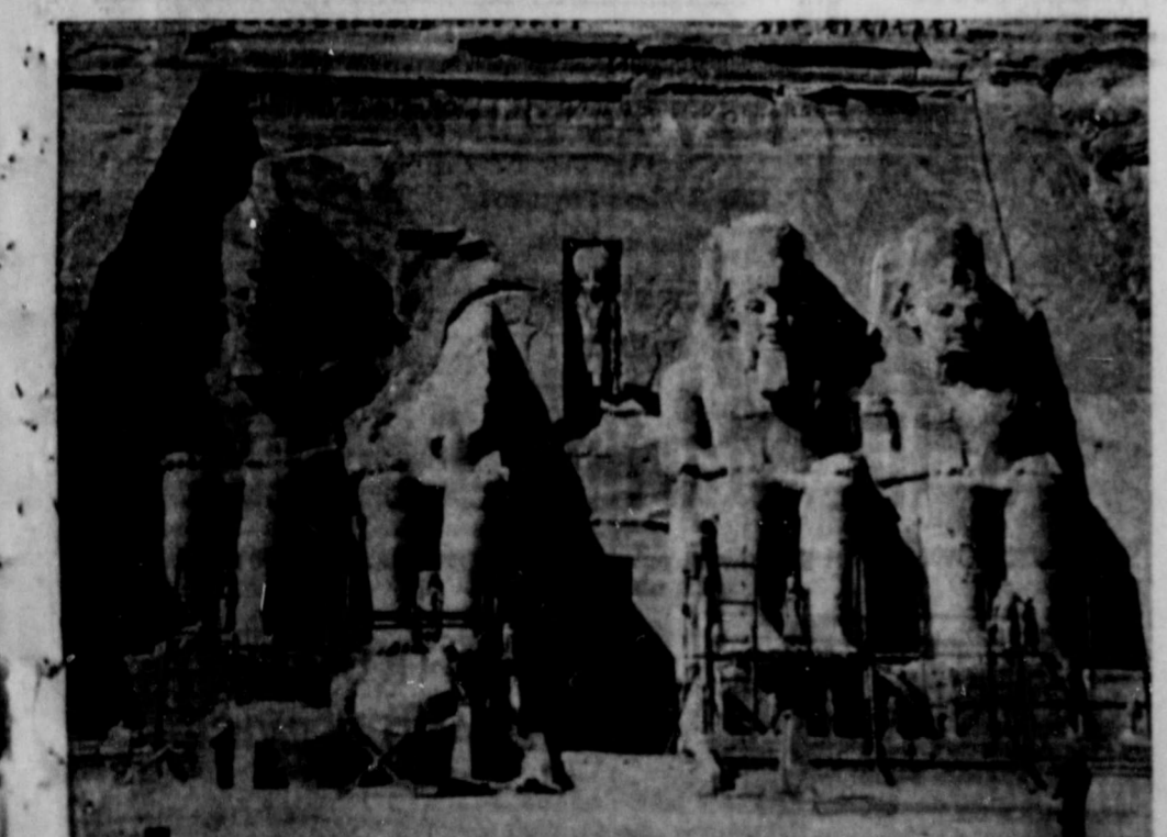
WILL THEY SAVE IT?—Archaeologists and engineers are wondering how this ancient temple in Luxor, Egypt, can be saved. The structure, built by Ramesses II, 3,000 years ago, rests on sand destined to be covered by waters backed up from the nation's Aswan dam. Suggestions range from creating a special dam around the temple to moving it elsewhere stone by stone.

He has been active in civic affairs, serving as President of the Palo Pinto County United Fund in 1959. In 1952 and again in 1954 he was honored as one of the outstanding young men of Mineral Wells. He served as State Vice President and National Director of the Junior Chamber of Commerce, and is presently Vice President of the Mineral Wells Lions Club. He and his family are members of the First Baptist Church of Mineral Wells.