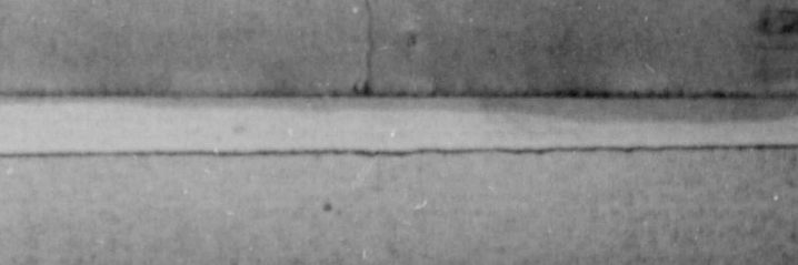
Tom Creighton Seeking Seat State Senate

Back to "gardening." Do you know that our Ranger Garden Club has big, big, big plans for (Continued on page three)