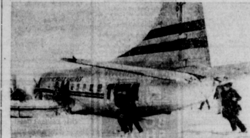
HELP AFTER SNOWY LANDING—Emergency crews rush to aid passengers of a twin-engine aircraft which made a successful belly-landing at Olathe Naval Air Station, Kansas.

The second annual Junior Leaders Training Conference, for leaders in the Boy Scouts of America, will be held March 19-20 in Breckenridge. The meeting will be in the Junior High School beginning at 9 a. m. on the 19th and continuing until 1:30 p. m. the next day.