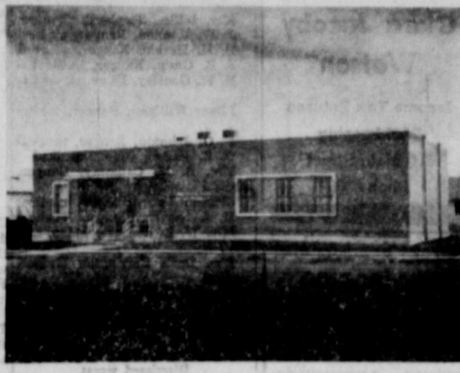
NEW TELEPHONE BUILDING —The new Ranger telephone building houses the complex switching equipment which will go in service here at 1:01 a.m. Sunday. The new building is one of many projects which were necessary to bring the new dial telephone service to Ranger.

Ex Parte: Anna James Little, (Continued On Page Four)