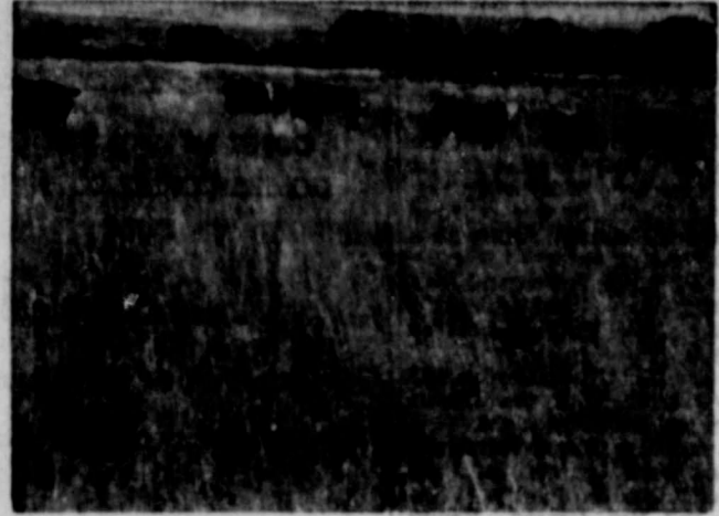
GOOD PASTURE —A cattle grazing reseeded pasture of blue stem mixture and Indian grass. Many old fields in this vicinity should be retired from cultivation and reseeded to adapted grass mixtures.

EMERGENCY TELEPHONE NUMBERS The Ranger Times has prepared a list of the new emergency telephone numbers to be delivered with the Thursday editions of the Ranger Times. The list of numbers has been printed on Orange-Red Radiant Pressure Sensitive paper with gummed back. Just peel the protective paper off the back and stick to your telephone or in a convenient place. It is easily removed and will not damage furniture. Only those customers served by carrier will receive the list, anyone else wishing a list of the numbers can pick them up at the Times office. We hope that this bit of service will be a reminder to you that the Ranger Times is here to serve you in every way.