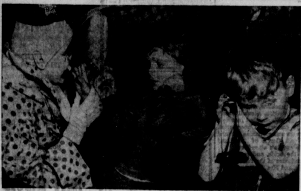
CIRCUS AT HIS FINGERTIPS—While his friend listens, a little boy gets his hand guided to the nose of a circus clown. The youngsters were among a group of blind children who attended the big show in Chicago. Supplied with earphones, they heard about the action through an announcer.