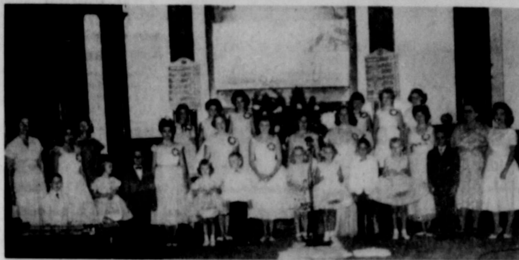
G. A. QUEEN'S CORONATION