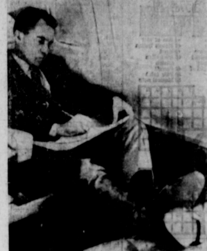
NURSING HIS KNEE — Vice President Richard Nixon is taking care of his left knee as he lies on a campaign swing through far West. He injured his leg on a Southern jaunt.