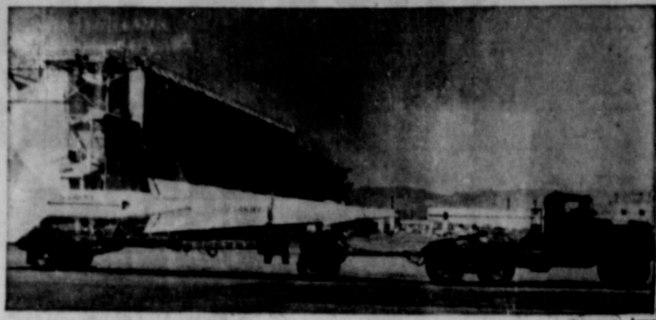
MOBILITY FOR NIKE HERCULES. A ready-round transporter developed for Army's NIKE HERCULES will enable fast moving field armies to add the HERCULES air defense guided missile to its arsenal of mobile weapons. NIKE HERCULES will give field armies a high altitude defense capability and will supplement the HAWK, a low-level surface-to-air killer. HERCULES is a supersonic guided missile with a range of over 75 miles and an altitude in excess of 150,000 feet. It can carry either a conventional or nuclear warhead.