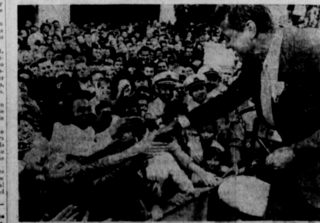
GLAD HAND FOR KENNEDY —Hands spring forth to shake the hand of Democratic candidate Sen. John Kennedy during a campaign stop through the Pacific coast. Scene is a downtown rally in Seattle, Wash.