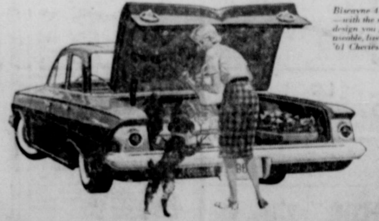
Biscayne 4-Door Sedan—with the same sensible design you get in all the available, livable, likable '61 Chevys.

★ For big car comfort at small car prices ★ ★ '61 CHEVY BISCAYNE 6 ★ ★ The lowest priced full-sized Chevy! ★ ★ Look over the '61 Biscaynes—6 or V8. ★ ★ They give you a full measure of Chevrolet quality and comfort — yet they're priced right down with many cars that give you a lot less! ★