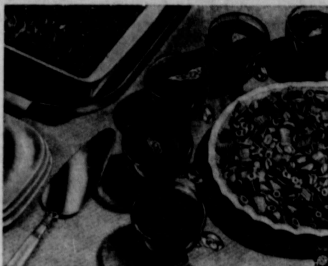
Having a buffet breakfast during the holidays? Here's a menu you can use for at-the-table breakfasting or for a tray meal in front of the Christmas tree, and at many another time throughout the year.

Tomato juice or fruit juice and the Cereal Snack-Mix—a gay medley of crisp ready-to-eat cereals, nuts, pretzel sticks, and intriguing flavor—may be served in the living room. For the main course, have piping hot oatmeal with raisins, milk, coffee cake, butter, with hot chocolate and coffee as beverages.