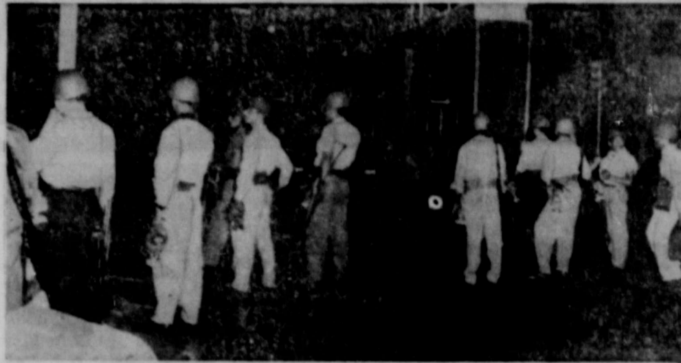
READY FOR TROUBLE—Members of the Venezuelan National Guard and city police post themselves in Caracas. Student riots broke out and revolution was feared.