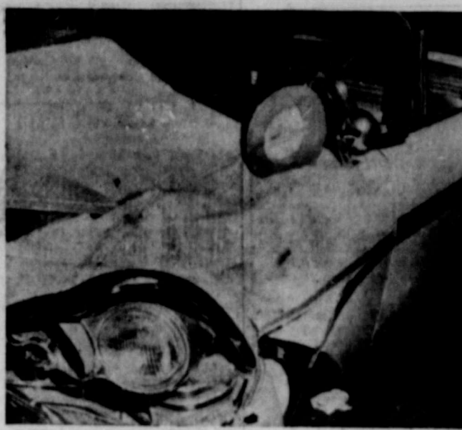
BODY CONTACT —Grim reminder of a tragic accident is represented by the hat of a victim. The car plowed into a New York sidewalk, killing five.