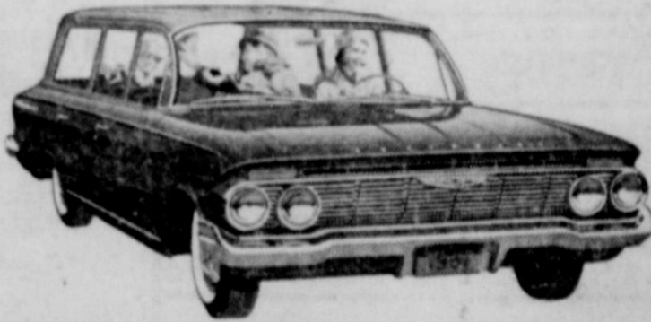
Brookwood 9-Passenger Station Wagon. One of 6 for '61. Each features a new cargo opening nearly 5 feet across and a new concealed compartment under the floor.