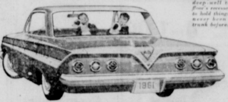
Impala Sport Sedan. All 5 Impalas feature the deep-well trunk—the floor's recessed a full 7" to hold things that have never been inside a trunk before.

No needless bulk or overhang here. This '61 Chevy is built on the principle that the place you want space is inside . We put it there, too. Actually trimmed the outer size to give you extra inches of clearance for parking and maneuvering, and still worked wonders with inner space. Door openings are as much as 6 inches wider. Seats are as much as 1 1/2 inches higher. We've thought of everything. Increased rear foot room by slenderizing the driveshaft tunnel. Worked in sensible new ideas all the way back through that huge bin of a baggage compartment. See how thoughtful this one is! Full of good new things. Full of good old things, too, like Chevy's well-known thrift and dependability. The new '61's at your Chevrolet dealer's right now.