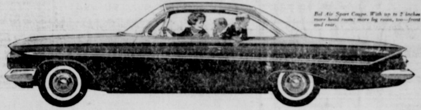
Big Air Sport Coupe. With up to 2 inches more head room, more leg room, too—front and rear.