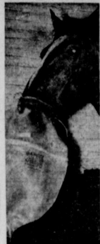
BREATHE IN—This fancy feed bag being sampled in New York is actually a portable oxygen mask for sick equines.

This is the first year that Humble has ventured into the hot Texas high school circuit to sponsor broadcasts and telecasts. Although definite arrangements cannot be made until the playing teams are all selected, Humble plans to beam the broadcasts into many areas of Texas.