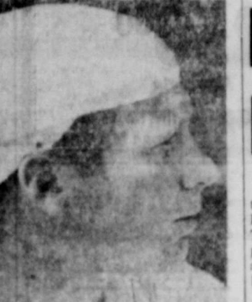
MANTLE OF ARABIA —Like an Arab shiek surveying the desert, Mickey Mantle beats the heat during New York Yankees baseball practice before first game of the season. His turban: a towel.