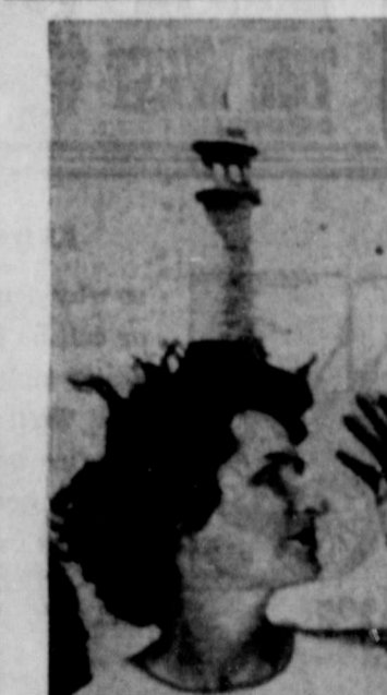
TEXANS AT THE TAJ MAHAL—Vice President Lyndon B. Johnson and his wife, Ladybird, are dressed for the 106-degree heat as they visit the Taj Mahal during their visit to India.

The position of the Postal Service can better be understood when it is pointed out that air mail envelopes are purposely created with their distinctive markings to identify air mail immediately and to make certain that it receives priority handling on the way from deposit to destination.