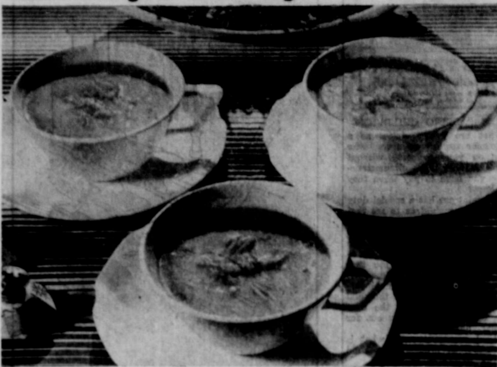
This tasty puree mongole with vegetables can form a meal in itself on a balmy spring day.