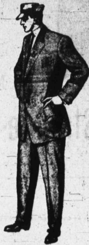
Copyright 1909 The House of Kuppenheimer Chicago

See that the coat bears the Kuppenheimer label, in that you are sure of getting good clothes. Don't buy the suit or overcoat by look alone for the important parts are hidden.