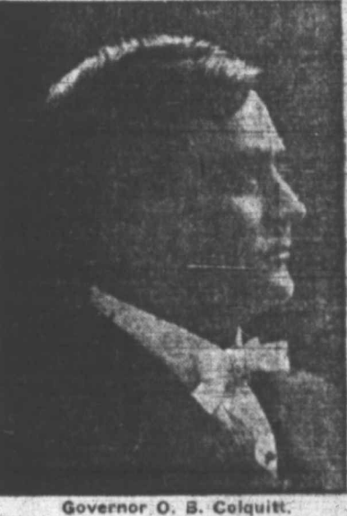
Governor O. B. Colquitt.

of office At 9 o'clock the gallery began to