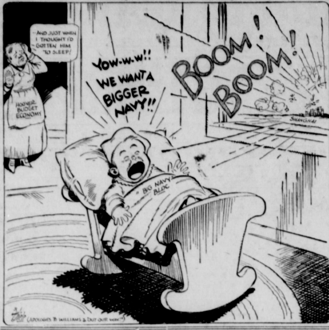
Character And Personality Are Revealed By Pen

Your character and personality are revealed by the point of your pen! Every time you write a word, your penmanship tells your traits.