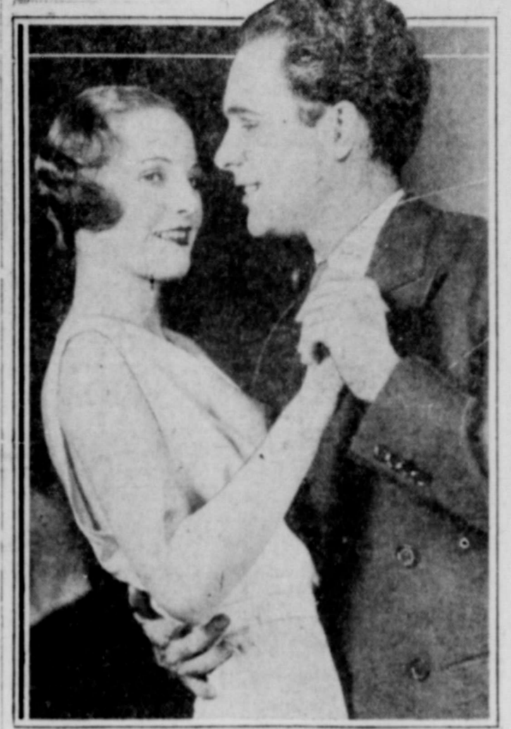
The two young people were almost alone on the floor.

Wife of dancing with a particular girl for an hour or so. After each of the short dances—the fast couples barely managed three turns of the room before the orchestra stopped—the girl would gravely detach one of the tickets from the long string proffered by her escort.