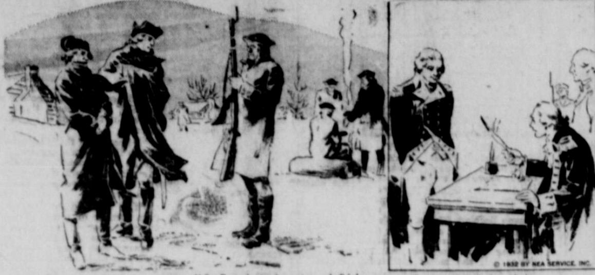
Washington held his strong position at Valley Forge despite the semi-starved, ill condition of his men.